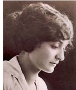
The founder's grandmother. Her sense of design was extraordinary.

St. Geneve began as a family business devoted to creating wonderful high quality duvets in the Vancouver area. Our duvets are now available at exclusive high quality bedding boutiques throughout the USA and Canada. Our reputation has led to orders from Germany, Switzerland and Great Britain. Our duvets and pillows are in the bedrooms of many celebrities.