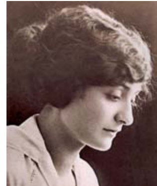
The founder's grandmother. Her sense of design was extraordinary.

St. Geneve began as a family business devoted to creating wonderful high quality duvets in the Vancouver area. Our duvets are now available at exclusive high quality bedding boutiques throughout the USA and Canada. Our reputation has led to orders from Germany, Switzerland and Great Britain. Our duvets and pillows are in the bedrooms of many celebrities.