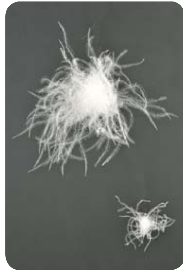
Actual Size Down Clusters

Mature down traps more air, puffs up more and breathes better than lower quality immature down. Since it takes less of a high quality down to fill a duvet, the best duvets are also the lightest and puffiest.