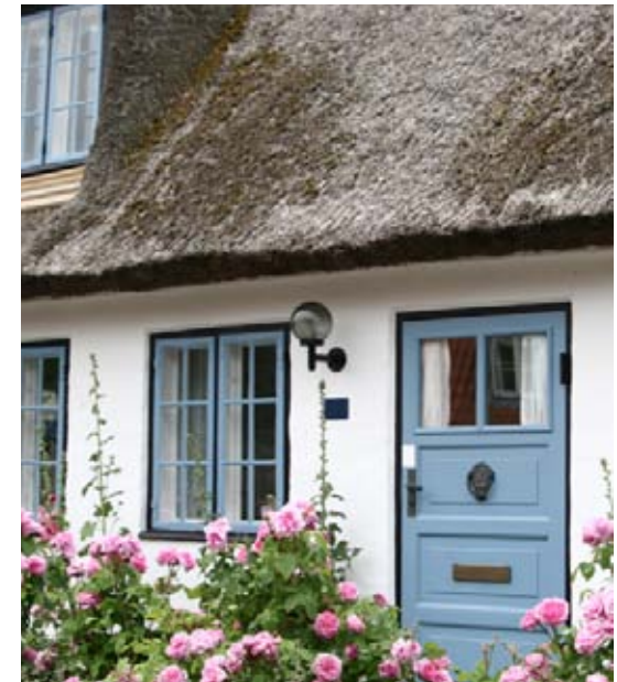
An Old Danish Farmhouse

Part of this tradition had the mother sewing a new coin into the duvet, for good luck all of their days. When we make a duvet, we do the same thing. St. Geneve duvets all have a coin sewn into it, in the same spirit of good wishes for our patrons.