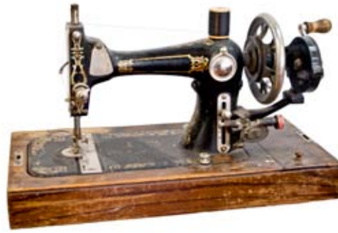
Antique Sewing Machine from the St. Geneve Collection

5. A duvet must have internal seams. The fabric should never be stitched straight through, but rather it should be tucked inside and sewn with no stitches visible on the surface of the duvet except for the edges.